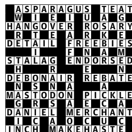
Solution No. 27,418