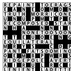
Solution No. 28,222