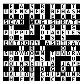
Solution No. 28,471