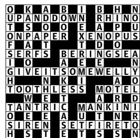
Solution No. 30,026