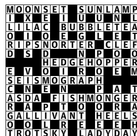
Solution No. 30,042