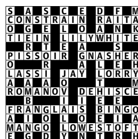
Solution No. 30,048